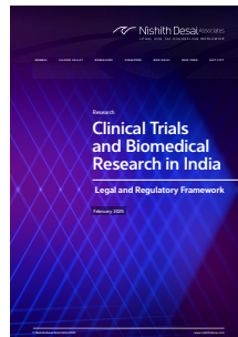
February 2025 Clinical Trials and Biomedical Research in India Legal and Regulatory Framework