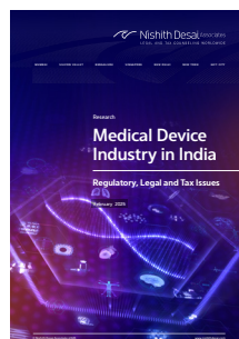
February 2025 Medical Device Industry in India Regulatory, Legal and Tax Issues