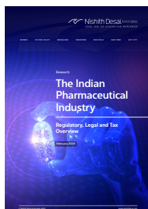
February 2025 The Indian Pharmaceutical Industry Regulatory, Legal and Tax Overview