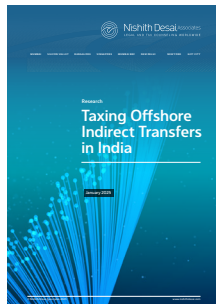
February 2025 Taxing Offshore Indirect Transfers in India

Extensive knowledge gained through our original research is a source of our expertise.