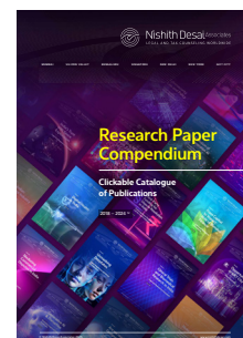
January 2025 Research Paper Compendium Clickable Catalogue of Publications