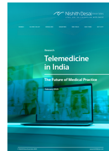
February 2025 Telemedicine in India The Future of Medical Practice