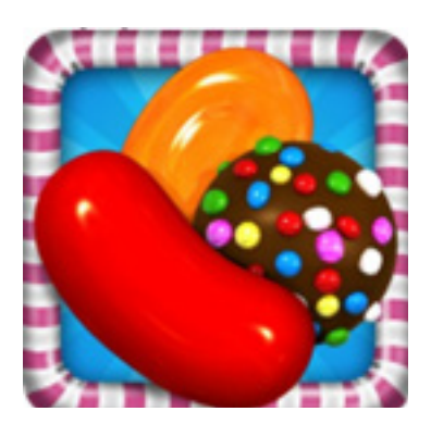
'Candy Crush Saga' logo mark

the Defendant from infringing King.com's copyright in the logo and from passing-off their events, advertisements, products or services as those of the King.com by using King.com's IP, whether in the logo or in the words 'Candy Crush'.