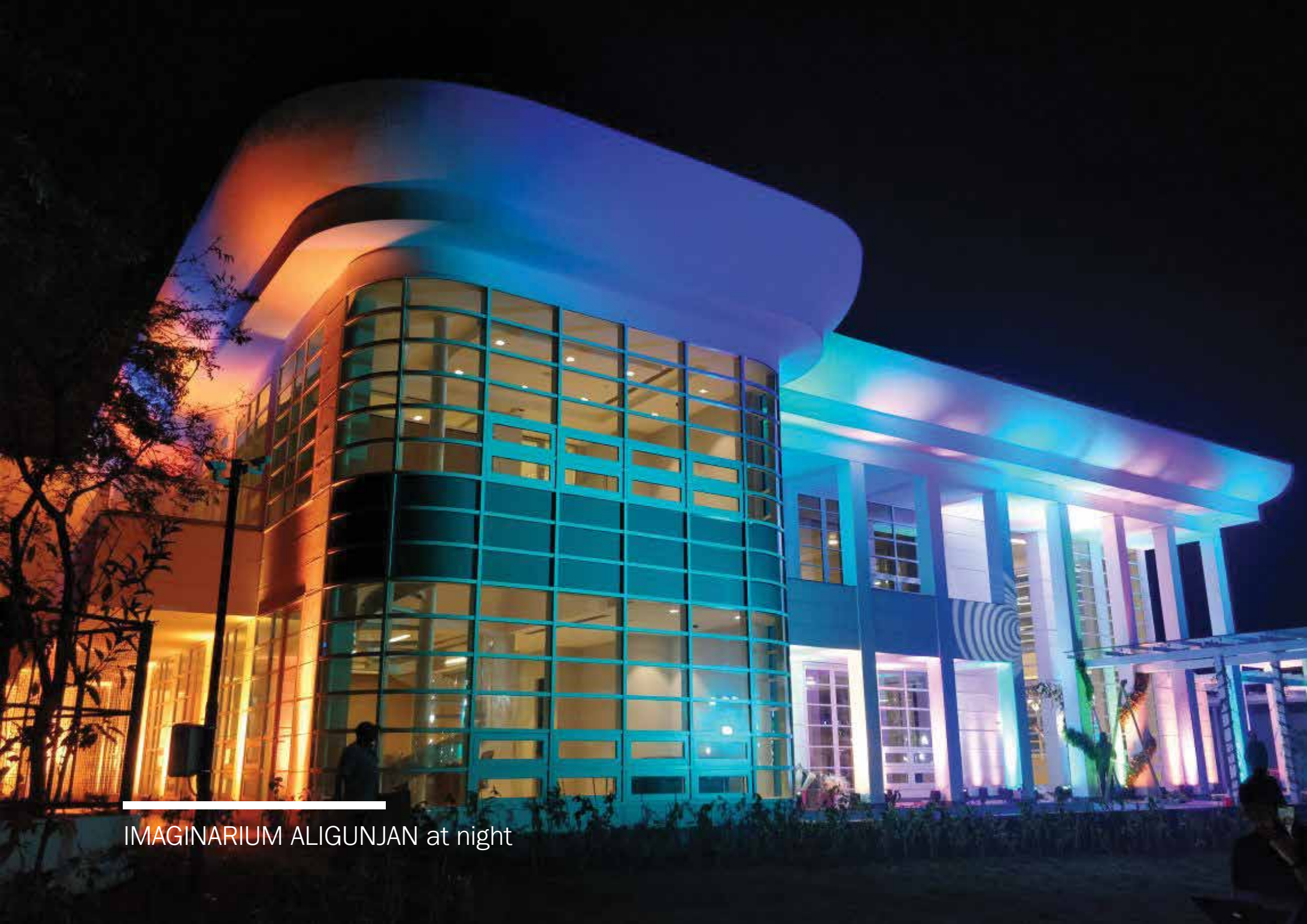
IMAGINARIUM ALIGUNJAN at night