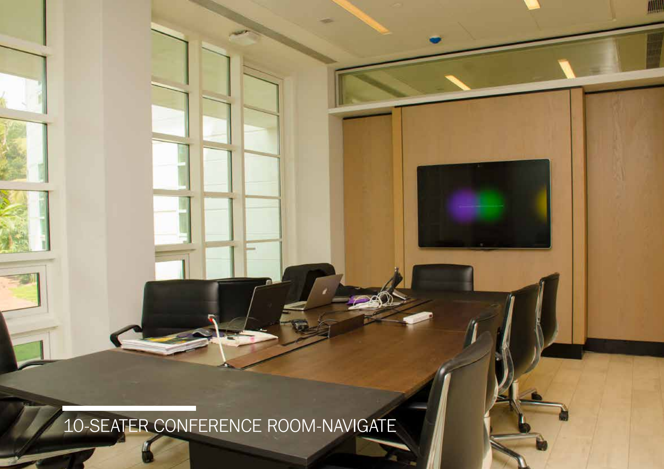
10-SEATER CONFERENCE ROOM-NAVIGATE