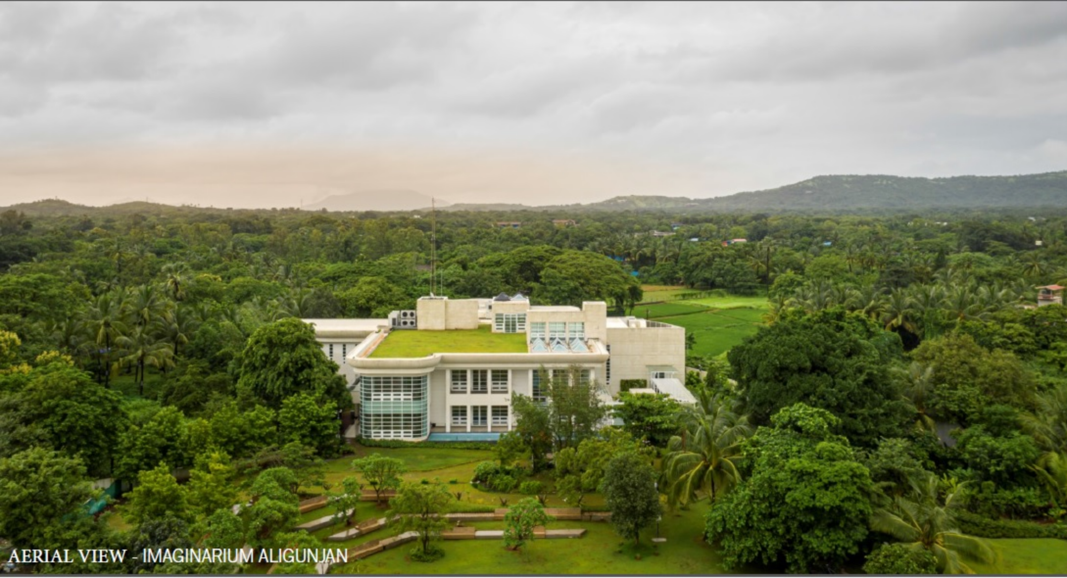
AERIAL VIEW - IMAGINARIUM ALIGUNJAN