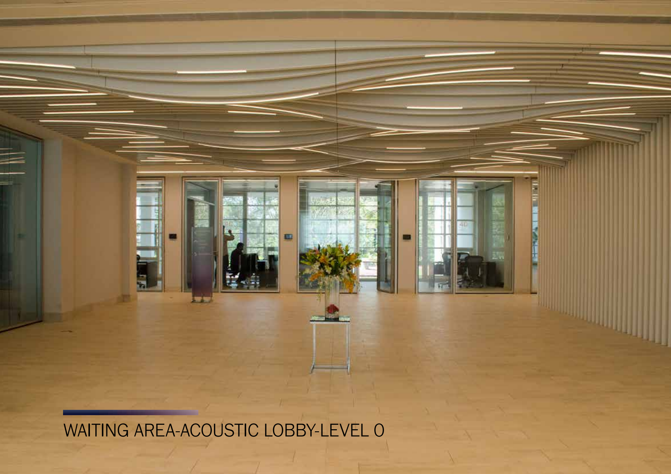
WAITING AREA-ACOUSTIC LOBBY-LEVEL 0