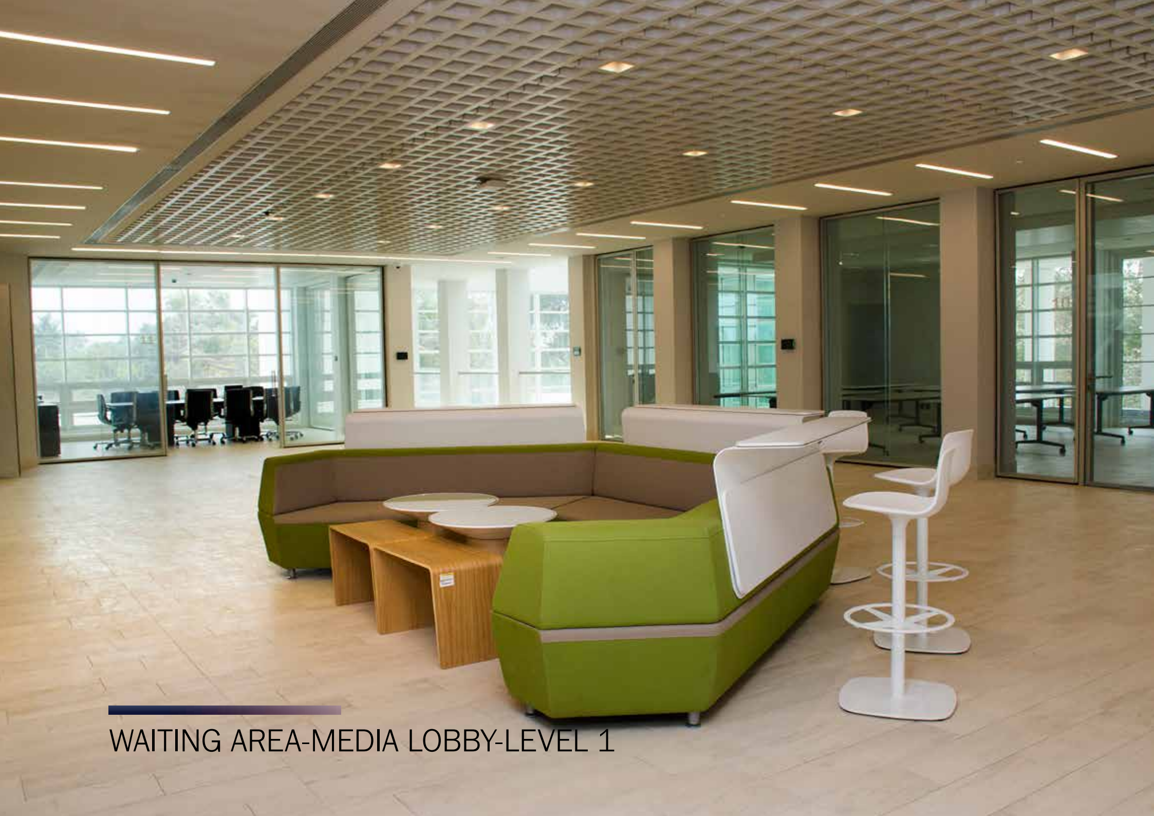
WAITING AREA-MEDIA LOBBY-LEVEL 1