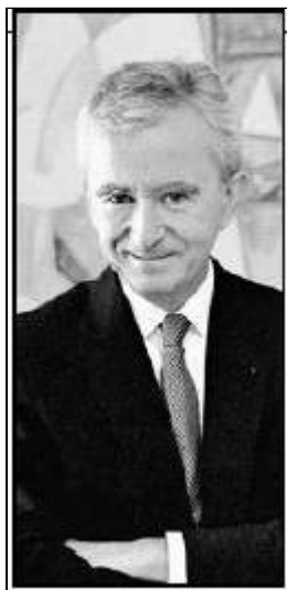
WHERE WILL HE GO: Bernard Arnault