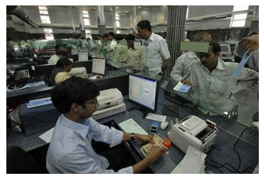
FRDI bill is depositor friendly, says Centre; consultants flag bail-in clause as a concern

By: FE Bureau | Mumbai | Updated: December 8, 2017 5:38 AM